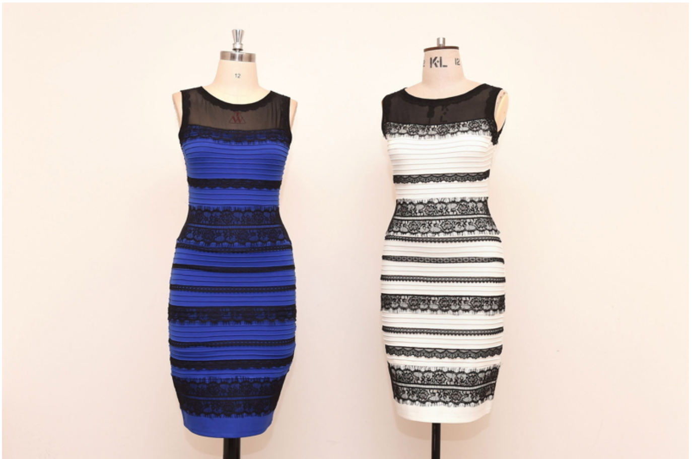
The original dress (left) from the catalog and another version in black and white