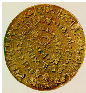
Phaistos Disk . 1,700-1,600 BCE. Clay tablet. Heraklion Archaeological Museum, Crete. http://www.philobiblon.com/isitabook/history

In many respects, the history of the book reflects the development of human communication. Not only does a book convey information, the form of books overtime reflects changing ideas and attitudes about what books are and what they do. The artist's book, which became popular in the 1960s, emerged in reaction to the mass-produced, uniform structure of the book. Book arts, as the field is known, takes structure a step further by providing an intimate, physical journey for the reader by exploring the book's form as well as the information it holds. With the predominance of technology in offset printing and desktop publishing today, fine-crafted artist's books are once again en vogue and gaining in popularity.